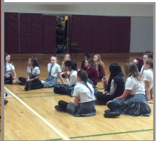
The first Cheer Club meeting