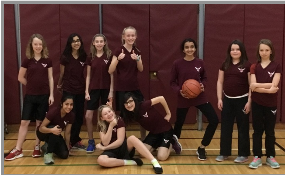
The junior Griffins basketball team