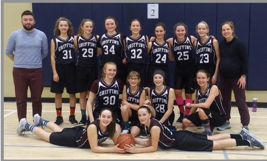
One of the Griffins senior basketball teams